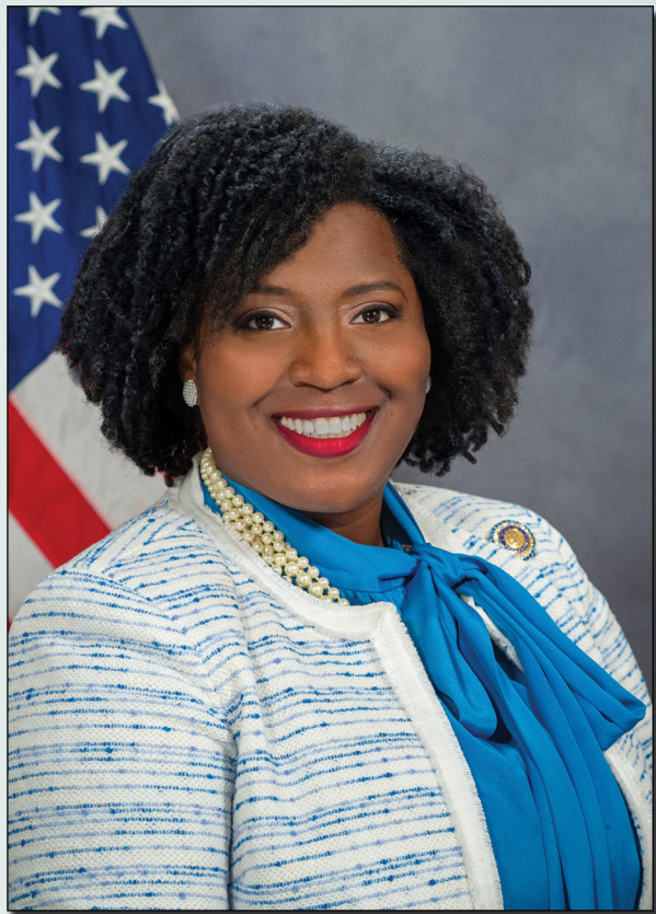
GUEST SPEAKER: THE HONORABLE JOANNA MCCLINTON FIRST WOMAN ELECTED PA SPEAKER OF THE HOUSE