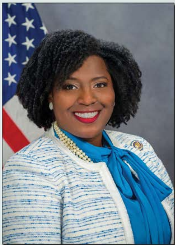
GUEST SPEAKER: THE HONORABLE JOANNA MCCLINTON FIRST WOMAN ELECTED PA SPEAKER OF THE HOUSE