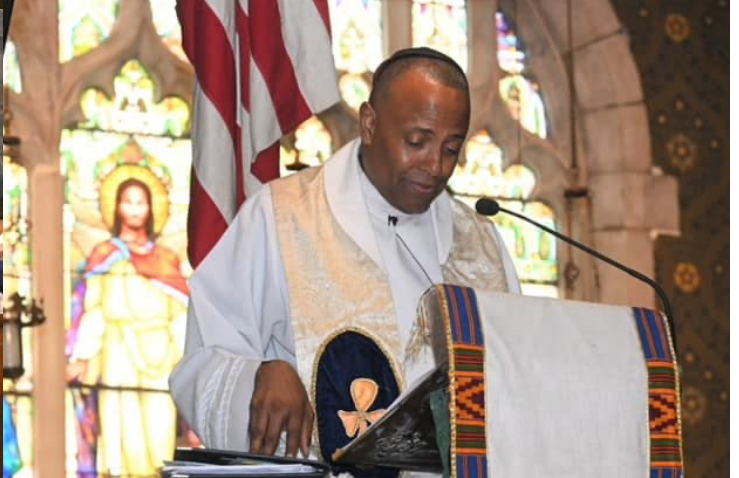
We celebrated Mothers/Mother Figures last Sunday.