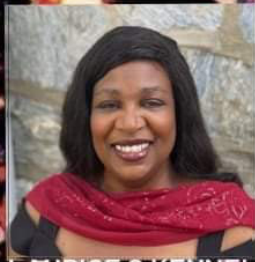
LAURICE S KENNEL SOPRANO