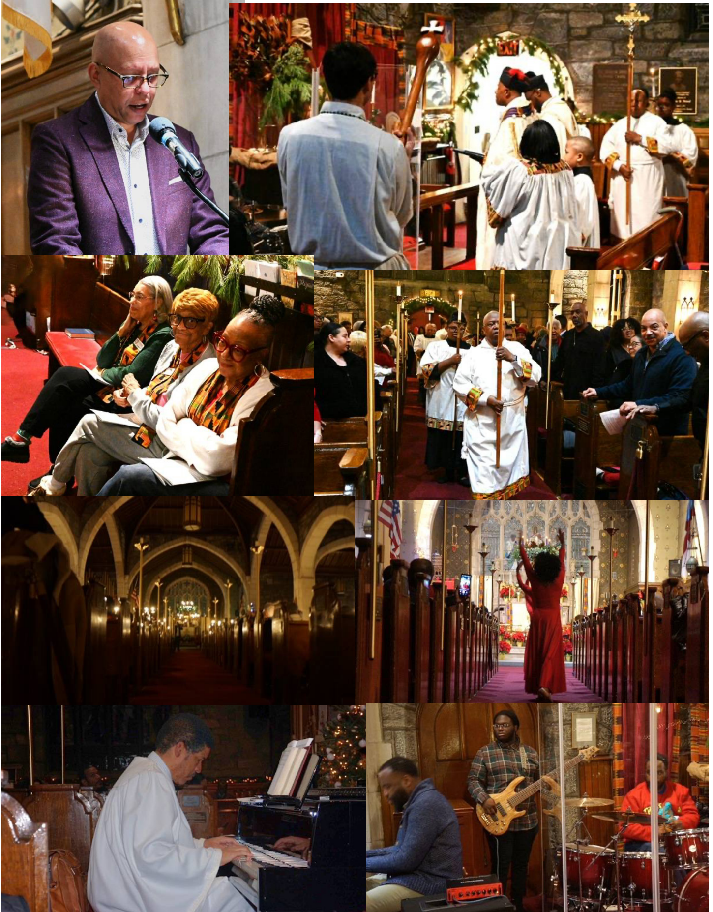
More pictures may be found on our Facebook page .