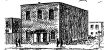
57th & Pearl Sts.