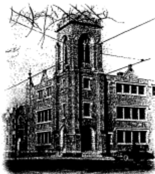
52nd & Parrish Sts.

On November 10, 1996, the church dedicated the Absalom Jones Chapel with a Festal Eucharist and enshrined his ashes in the altar. In addition, the Absalom Jones Memorial Stained Glass Window was installed and dedicated in July 1997. A stained glass window featuring Black Saints and Black Bishops past and present was also installed in 2000.