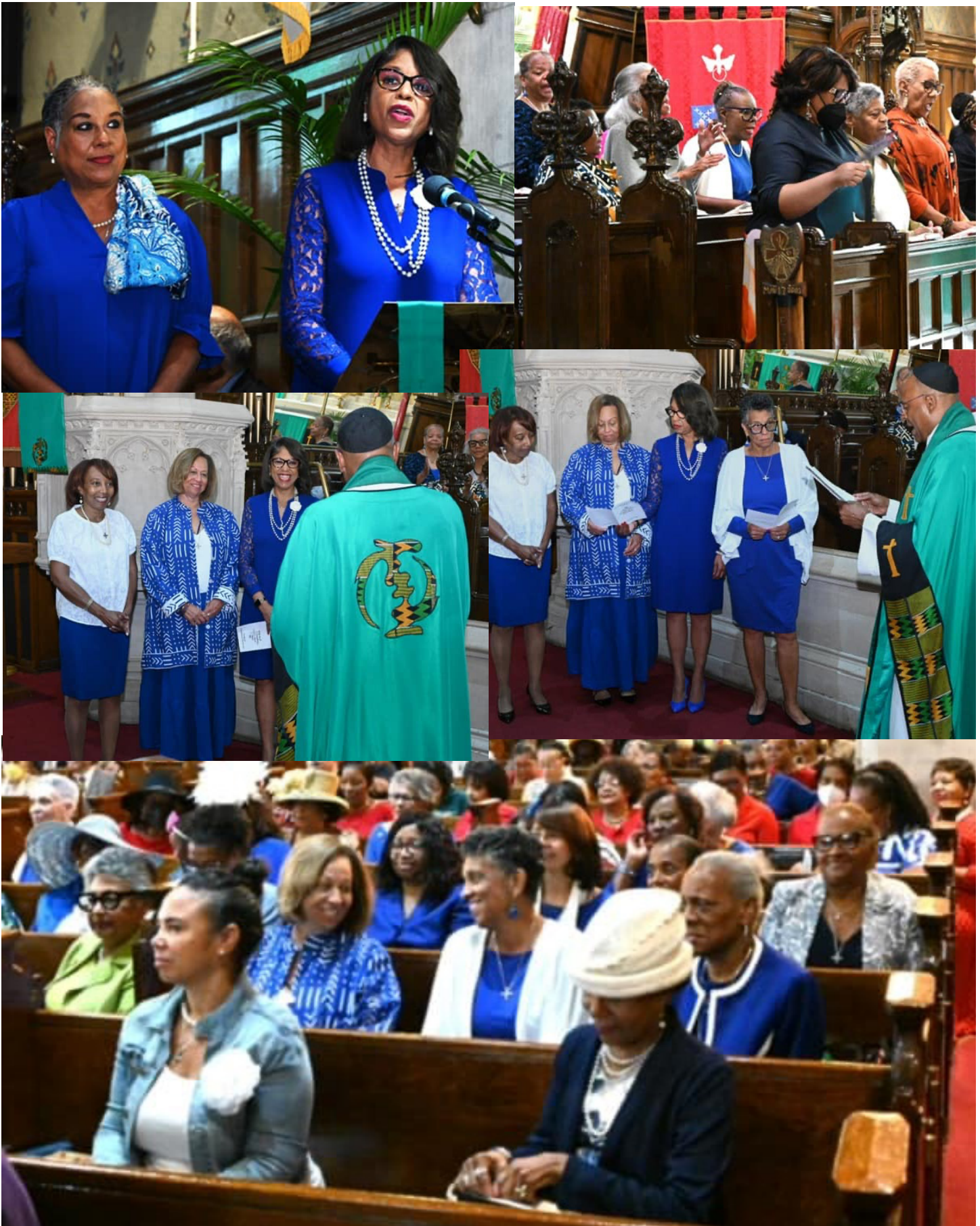
More pictures may be found on our Facebook page.