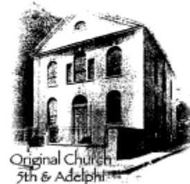
Original Church 5th & Adelphi

Originally established as the African Church, The African Episcopal Church of St. Thomas was founded in 1792 by and for persons of African descent to foster personal and religious freedoms and self-determination. The original African Church was an outgrowth of the Free African Society - a mutual aid organization established in 1787 by Absalom Jones, Richard Allen and others -to assist the Black population in Philadelphia. The early religious services were held in private homes and in a school. Within the congregation were many who -because of growing racial tension and insults -had followed the lay preachers, Absalom Jones and Richard Allen, in an historic walkout from St. George's Methodist Church. Affiliation with the Episcopal Church was ratified in 1794. The Reverend Absalom Jones became the first Episcopal priest of African American descent and the first rector of St. Thomas' Church.