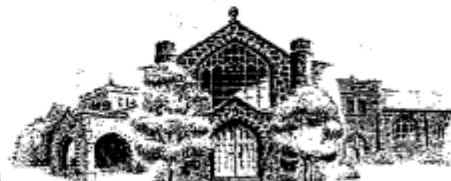
Current Location Overbrook & Lancaster Aves.

Today, the African Episcopal Church of St. Thomas flourishes as an open, Christ-centered community of faith where the Gospel is taught, lived and spread.