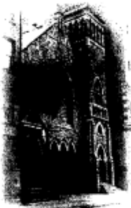
12th Below Walnut St.

The original church house was constructed at 5 th and Adelphi Streets in Philadelphia, now St. James Place, and dedicated on July 17, 1794. Subsequent locations of the church included: 12 th Street below Walnut; 57 th and Pearl Streets, (uniting with the Church of the Beloved Disciple); 52 nd and Parrish Streets; and the current location, Overbrook and Lancaster Avenues (formerly St. Paul's Overbrook) in Philadelphia's historic Overbrook Farms neighborhood. The congregation has continued to be predominately African American.