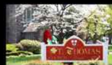
AFRICAN EPISCOPAL CHURCH OF ST THOMAS

Please register on our Website www.marianandersonhistoricalsociety.weebly.com OR CALL OUR OFFICE @ 215-779-4219 OR SEND IT IN TO OUR OFFICE @ 762 s. Martin Street Philadelphia Pa 19146 TO CONFIRM YOUR TICKETS