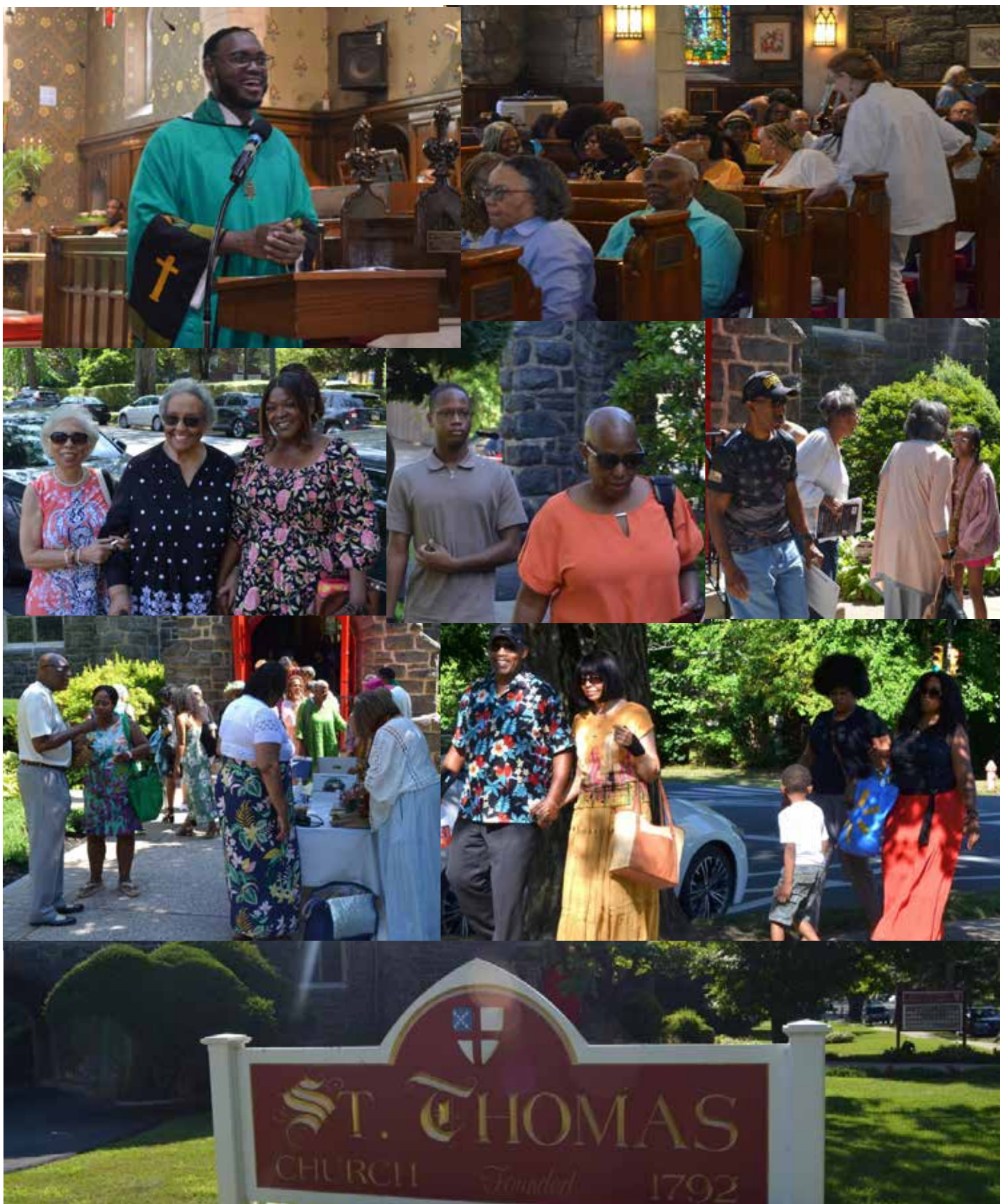
More pictures may be found on Facebook.