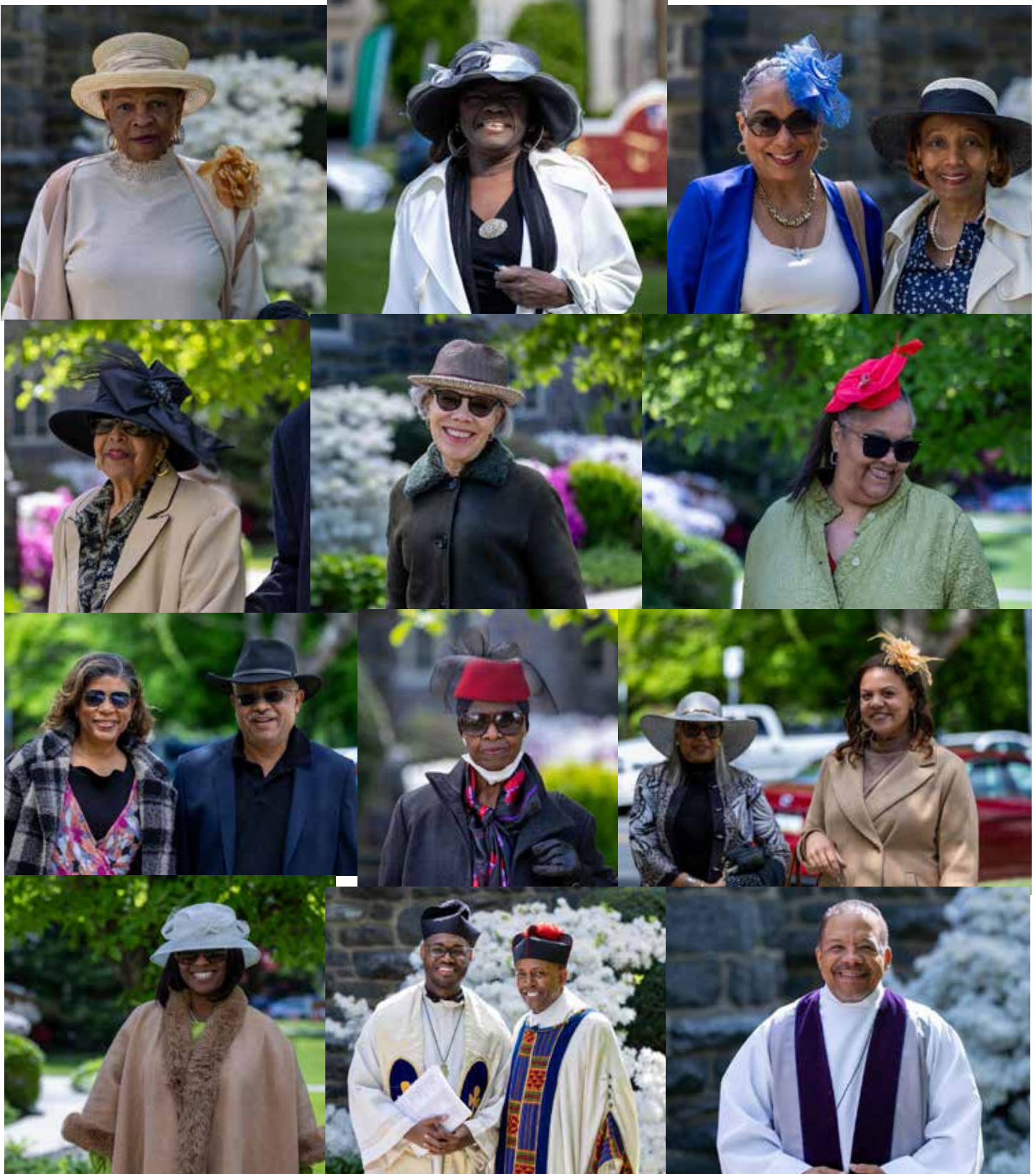
More photos may be found on Facebook