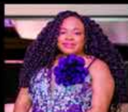
SOPRANO JILLIAN PIRTLE