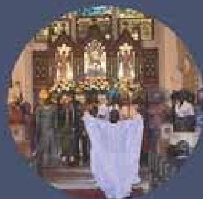
St. Thomas Gospel Choir of Philadelphia