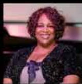
SOPRANO LAURICE KENNEL