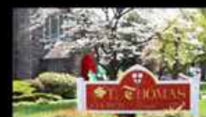
AFRICAN EPISCOPAL CHURCH OF ST THOMAS

Please register on our Website www.marianandersonhistoricalsociety.weebly.com OR CALL OUR OFFICE @ 215-779-4219 OR SEND IT IN TO OUR OFFICE @ 762 s. Martin Street Philadelphia Pa 19146 TO CONFIRM YOUR TICKETS